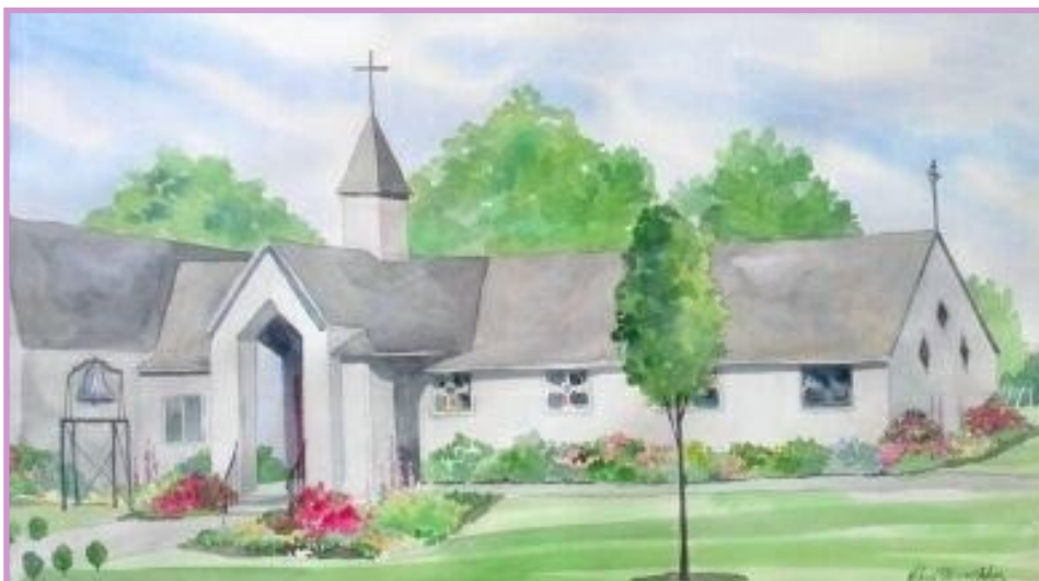
The Episcopal Church of St. Alban