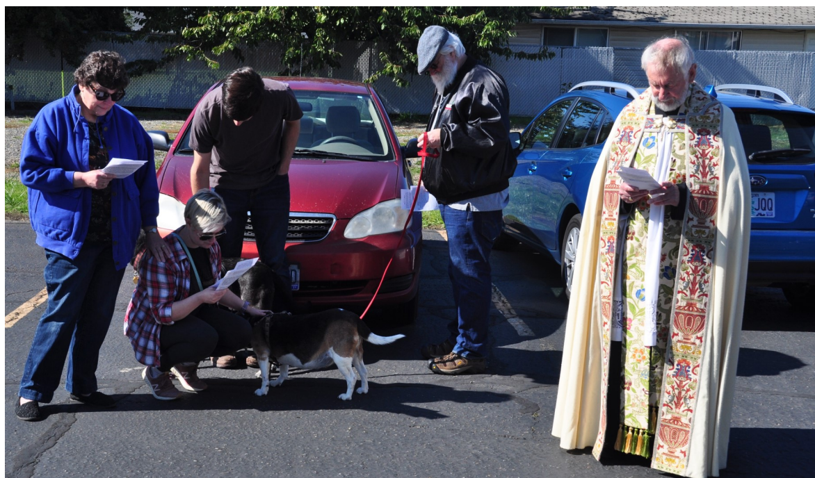
Oct 6th, 2019 Pet Blessing

Men's Night Out - Our every-now-and-then get together is next scheduled for Wednesday Oct. 18th at the Calapooia Brewery starting at 5:30pm. The St Albans Men's Group is open to all men of the congregation....that's right, if you are male, you are a member of the St Albans Men's Group! Come join us for some conversation and fellowship.